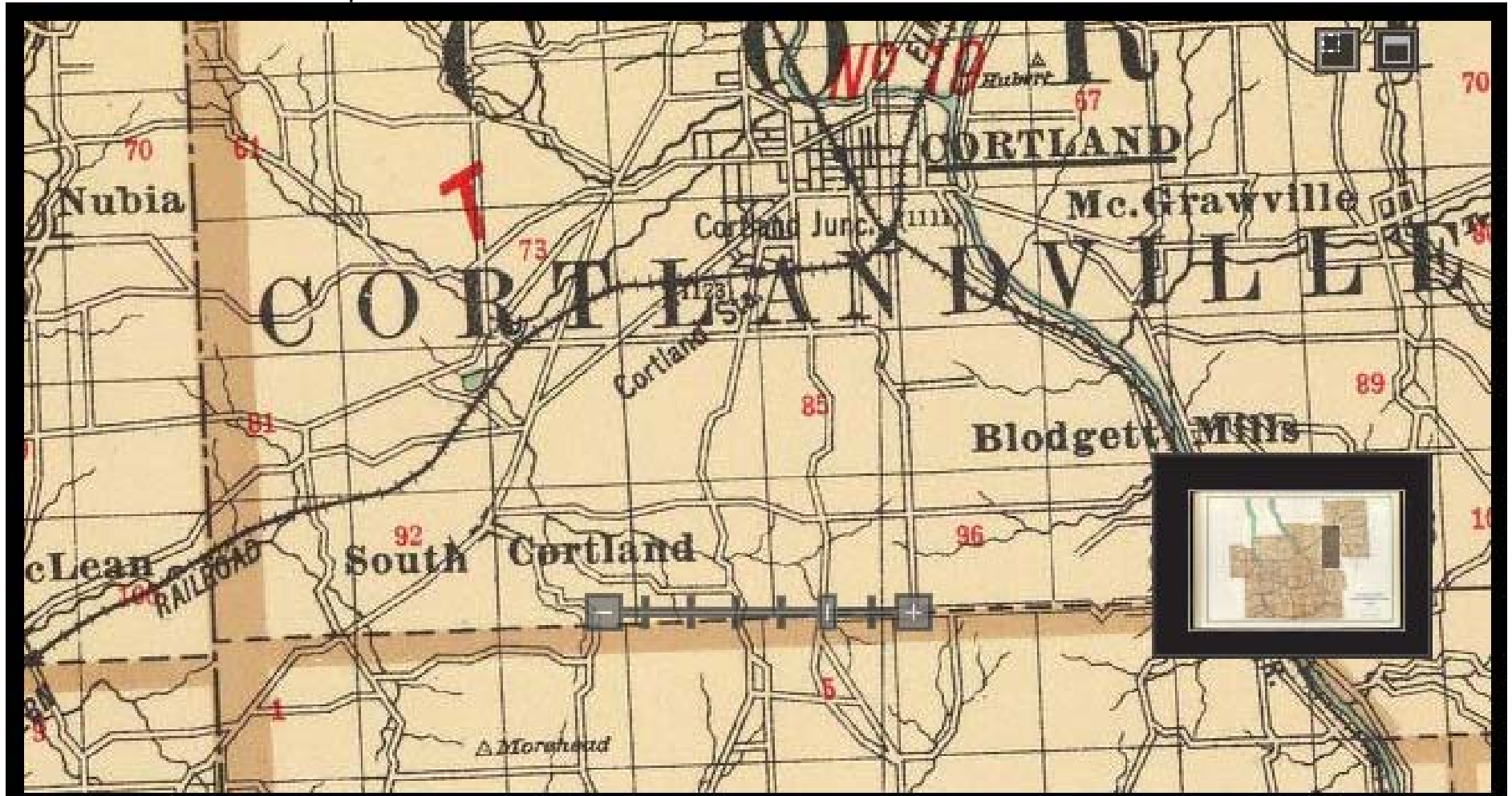
Detail from 1895 atlas map