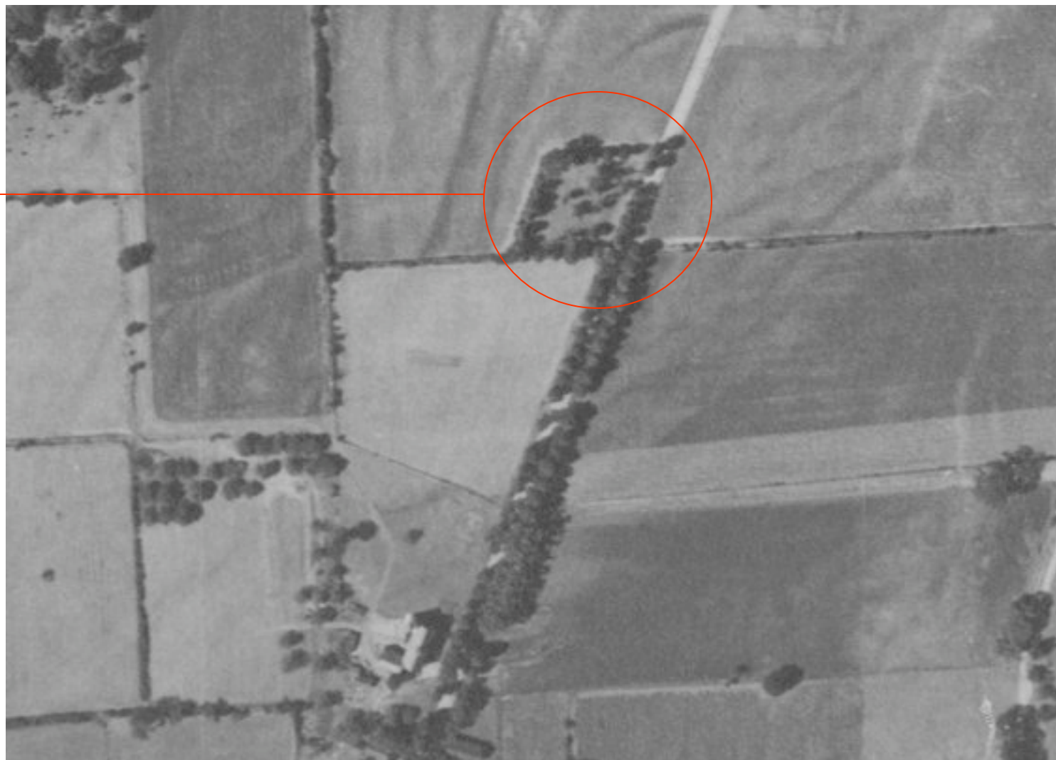
South Cortland Cemetery

http://aerial-ny.library.cornell.edu/photos/cortland